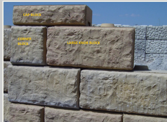
(Above picture shows corner, large and cap knob blocks)