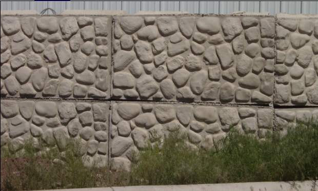
2-Yard Retaining Wall Blocks 3' x 3' x 6' (8000 lbs) $160 Plain Sided $190 Stone-Face