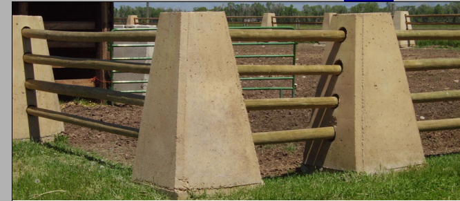
Fence Posts (6,000 lbs) 5' x 2' x 2' base 1' x 1' top $185 Small 5' x 3' x 3' base 1' x 1' top $235 Large