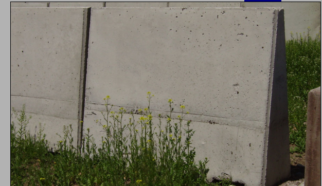
Bull Pen Fence Blocks 6' long, 5' tall, 2' base and 6" top (5000 lb) $195 9' long, 5' tall, 2' base and 6" top (7500 lb) $260