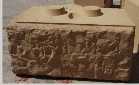
Large Knob Block 2' x 2' x 4' (4700 lbs) $160 Stone-Face $140 Plain