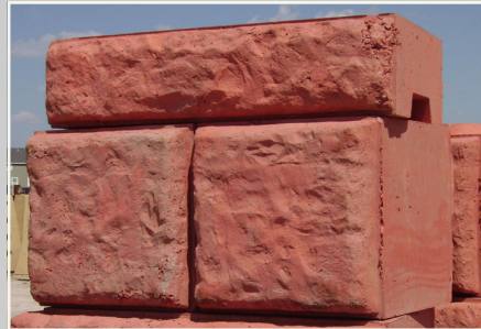
Half Knob Block 2' x 2.5' (2350 lbs) $130 Stone-Face $110 Plain