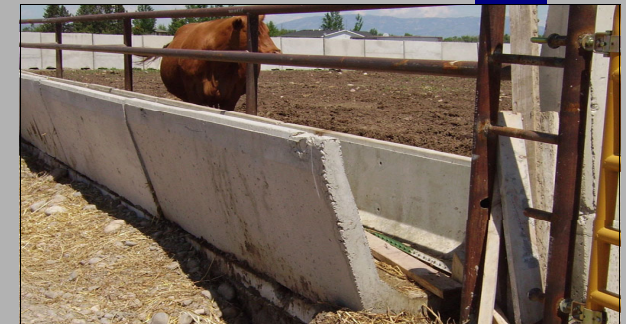
Feed Bunks 8' Long, 33" Tall Back, 16" Front Lip (2700 lbs) $160