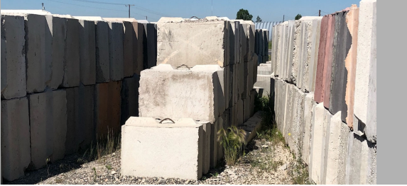
1/2 Yard Retaining Wall Blocks 2' x 2' x 3' (2,000 lbs) $ 75 Each