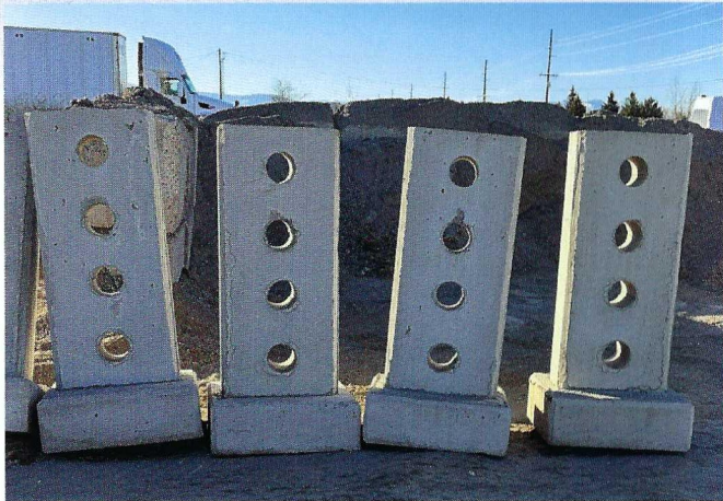
6,000 lbs Rectangular $230 5' x 2' x 2' Base; 1' x 1' Top